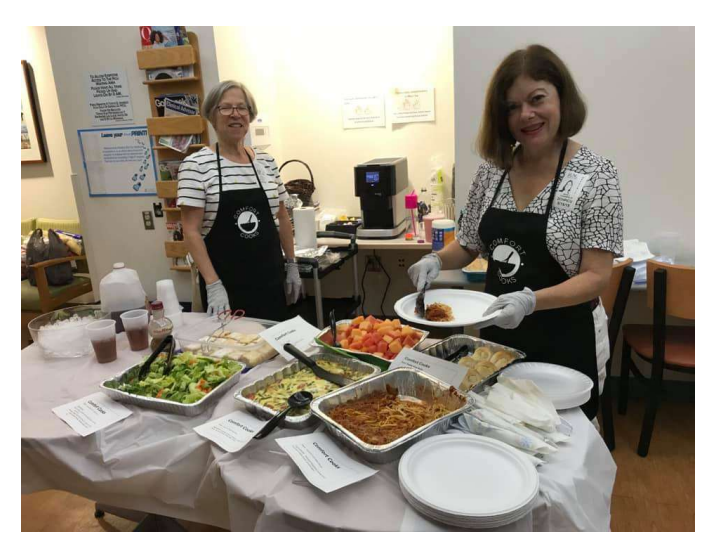
Comfort Cooks in action