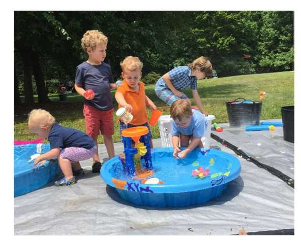
Fun at the Annual Picnic

(Amounts are fund balances at time of printing)