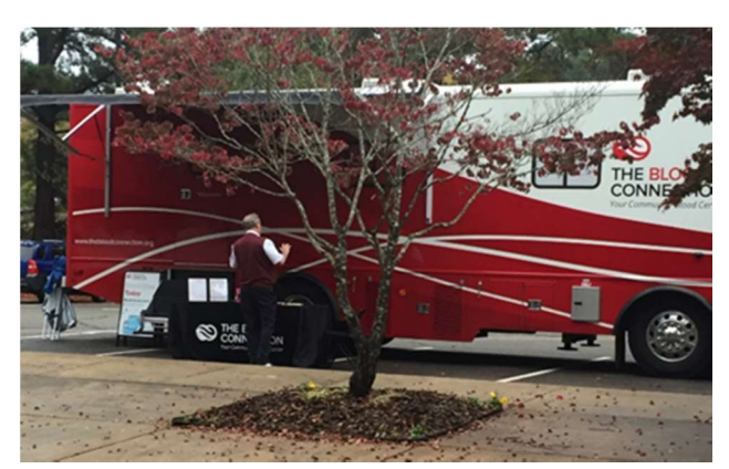
October BloodMobile event