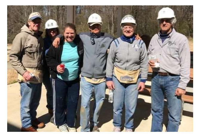
Habitat rest break