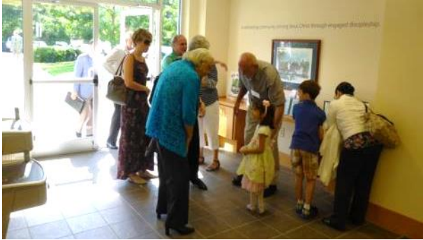
Greeting at NRPC on Sunday Morning

Our worship together will demonstrate a vibrant and spiritual community of faith that attracts current and future members.