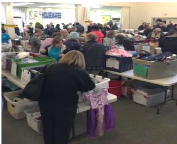
NRPC Yard Sale

Outreach to those in need is an important value that NRPC instills in all of its members. One example of the church embracing outreach comes from our youth – a young member initiated a project to collect and distribute hand warmers and non-perishable and easy to eat foods in easy to grab bags that can be kept in one’s car and given to those asking for assistance in our everyday lives.