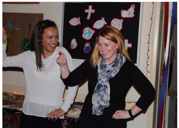
Youth Hosted Social Dance