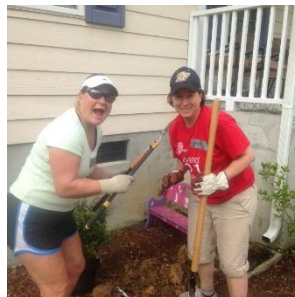
Habitat for Humanity