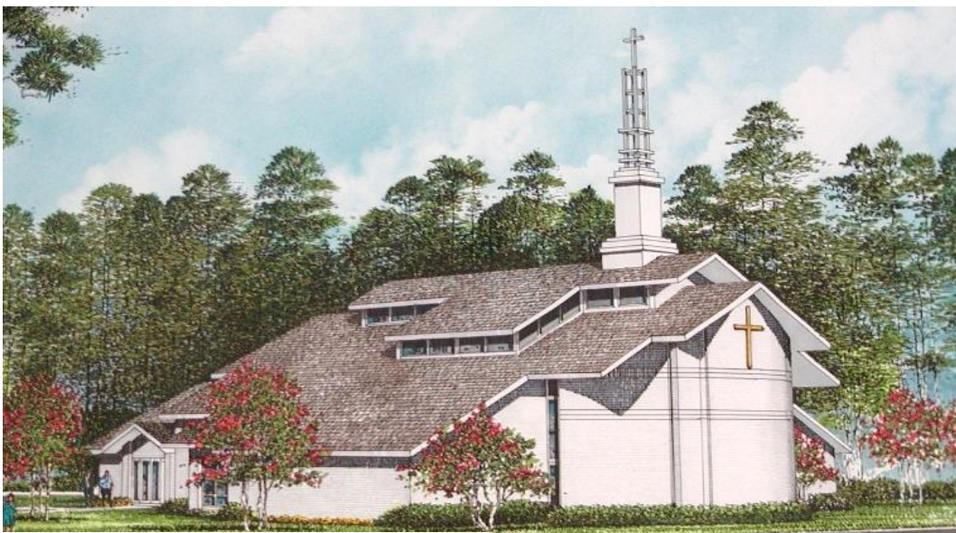
NRPC Artist Rendering

http://www.northraleighpc.org/diaconate.html