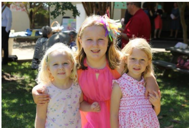
Annual Church Picnic

NRPC, a welcoming community of faith, is a congregation with a strong desire to fulfill God's mission. As a congregation we seek to discern His will for our church, as individuals and as a community. We will worship with faith, hope, and trust in the Lord. Our goal is to continue to build on the foundation of our church. We seek God's call and realize we are one church and will move forward together. We will begin to see the long-term vision of NRPC. Our strategic emphases will be: Worship, Leadership, Congregational Care, Christian Education, and Outreach.