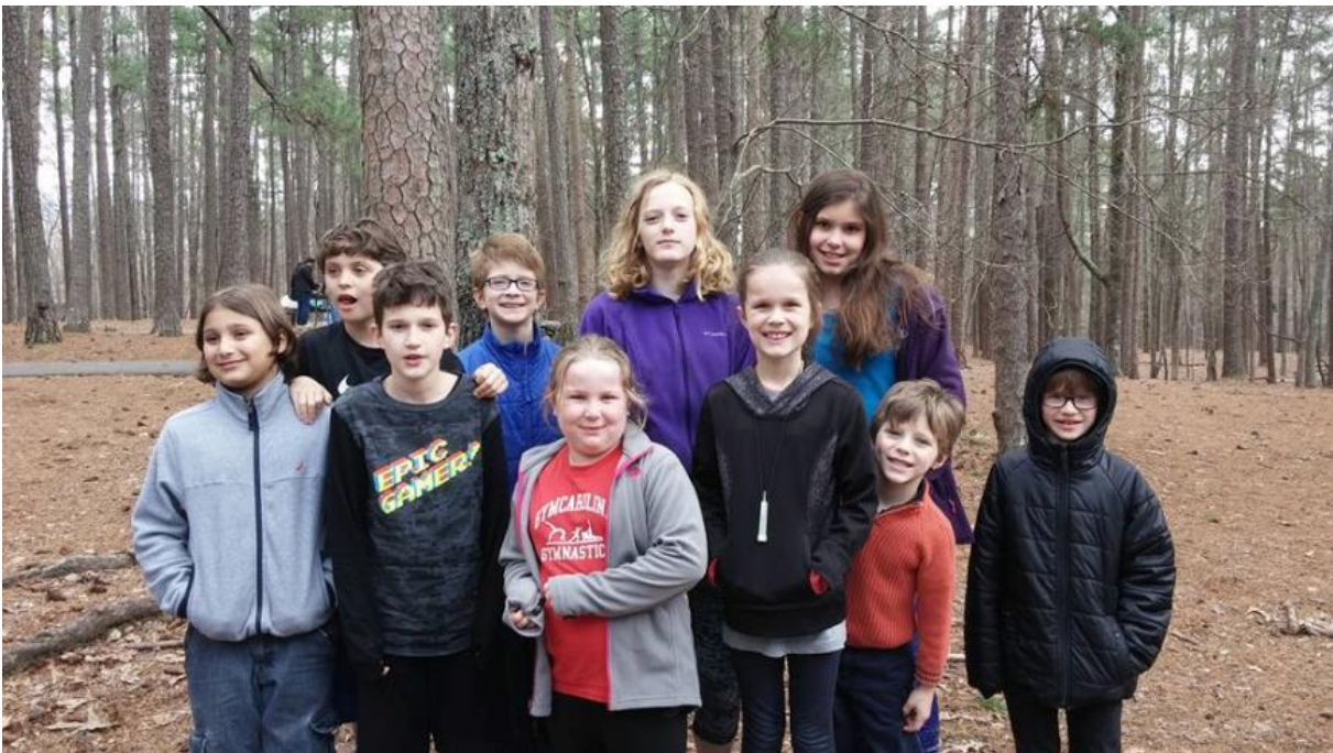
3 rd -5 th Grade Youth Fellowship