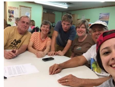
Appalachia Service Project