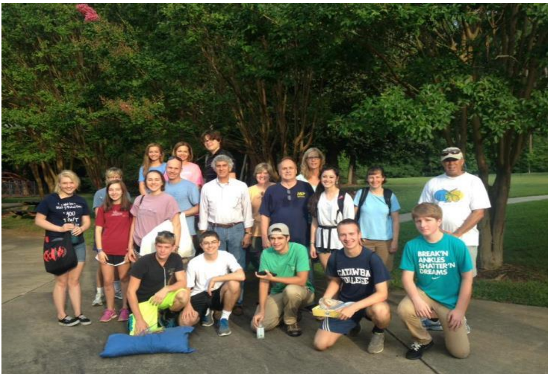
NRPC Appalachia Service Project Team